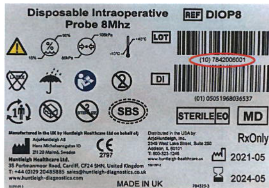
DIOP8 Probe (Pouch) Label