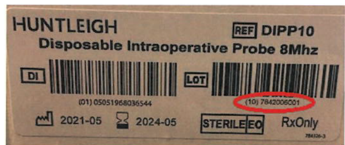
DIPP10 Box Label

Distribution Date: 30 th Sept 2021 to 31 st January 2022