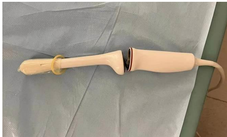
Figure 1. Transducer Bond Failure

Philips has received complaints associated with this issue; however, there are no reports of injury or serious harm.